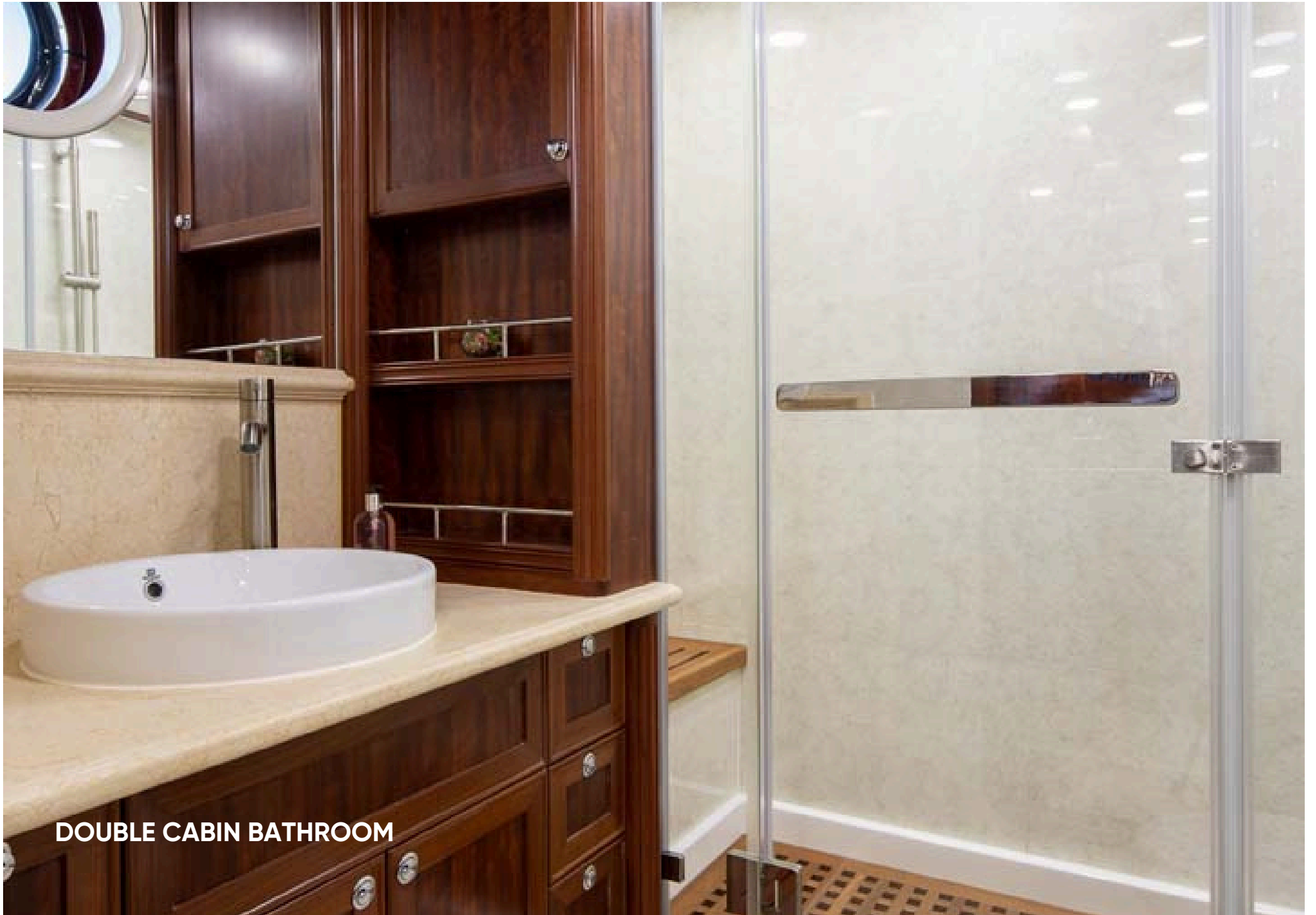
DOUBLE CABIN BATHROOM