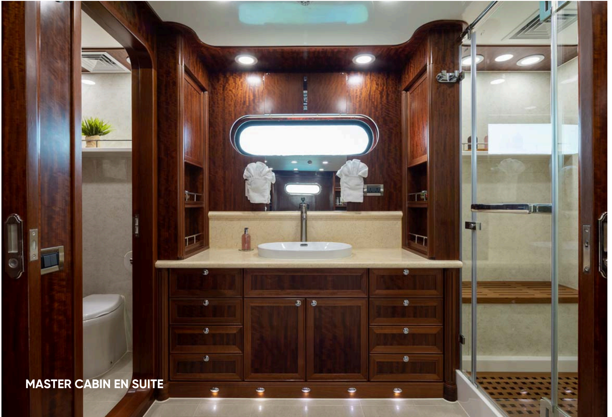
MASTER CABIN EN SUITE