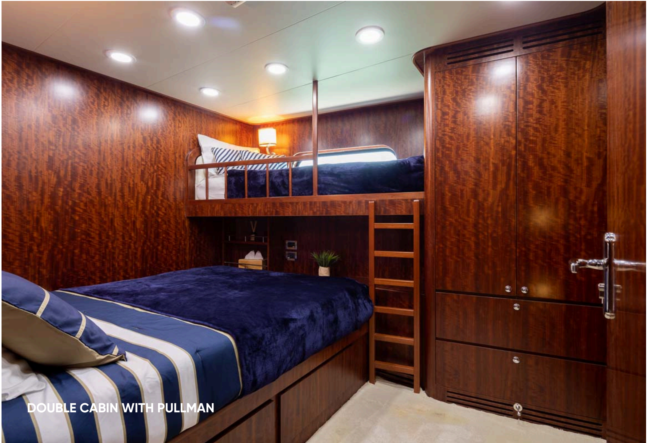
DOUBLE CABIN WITH PULLMAN